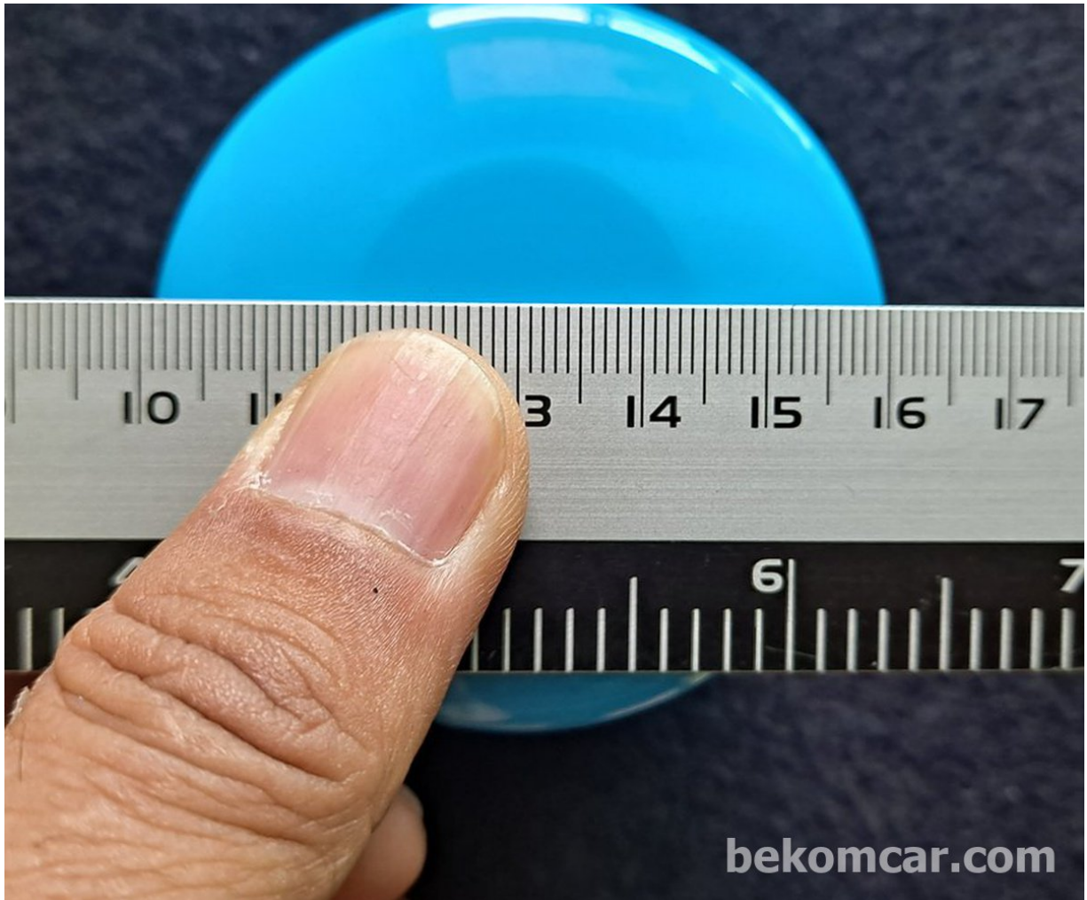
Diameter of the bottom Honda engine oil filter.-