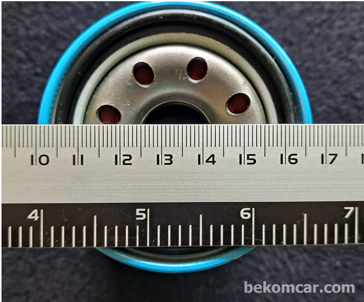
Diameter of the top Honda engine oil filter with the gasket.-